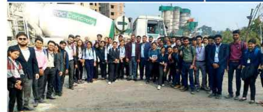
Industry Visit - RDC Concrete