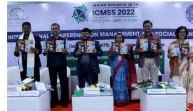
ICMS (First Edition)