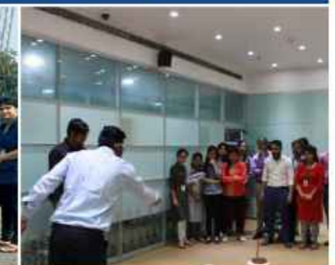
Certificate Programme By IRMA